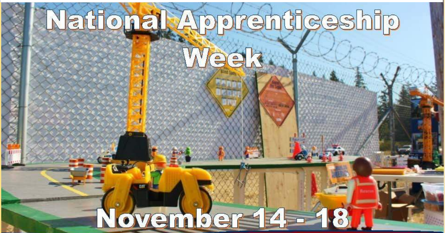
JBLM Apprenticeship Fair—September 2012