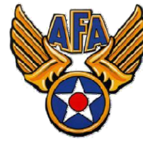
McChord Air Force Base Chapter Air Force Association