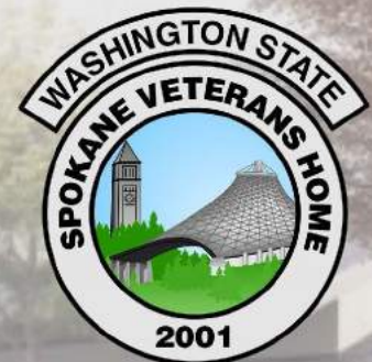
Spokane Veterans Home

Email communications@dva.wa.gov for a downloadable template