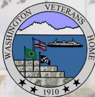
Washington Veterans Home in Retsil