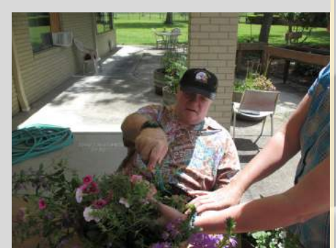
www.dva.wa.gov "Serving Those Who Served"