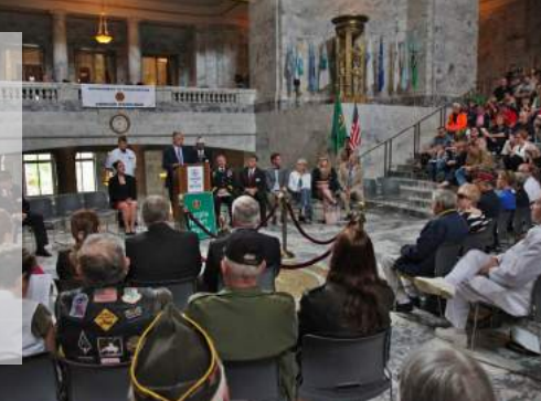
Olympia Thunder Run -Memorial Day Ride to the Capitol & Thurston County Veterans Council Memorial Day Ceremony

See more Memorial Day Event Photos by visiting our FlickR webpage at: <u>https://www.flickr.com/photos/98326753@N03/albums</u>