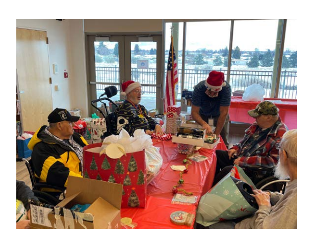
Walla Walla Veterans Home Holiday