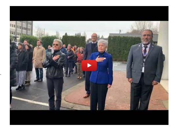
Traveling Flags of Honor Visit WDVA Central Office